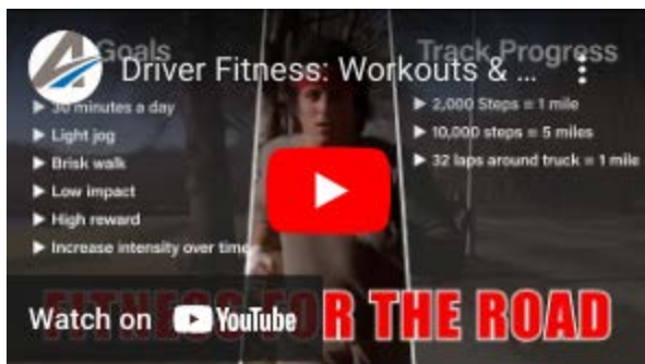
Driver Fitness: Workouts & Cardio to Keep You Rollin'