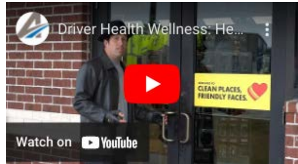
Driver Health Wellness: Healthy Meals via YouTube

We kicked off this year's Blitz with a focus on the fuel we give our body to sustain a healthy lifestyle. Healthy Meals , Healthy Snacks , and Hydration are key factors to providing our bodies with the nutrients it needs to go the distance.