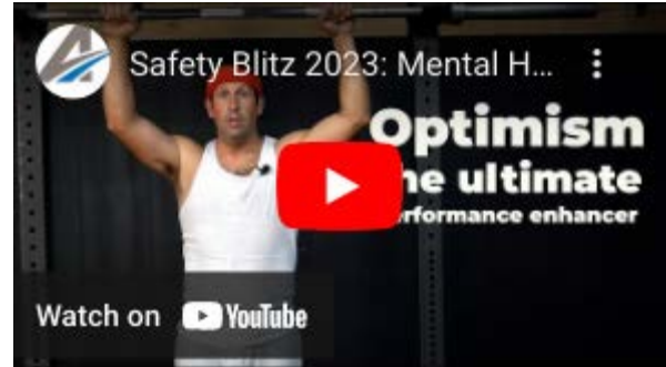
Safety Blitz 2023: Mental Health via YouTube

Taking care of your Mental Health is as crucial as physical exercise. One in five American adults deal with a mental health condition every year, and it can be overwhelming. Prioritizing your mental health is essential for your well-being.